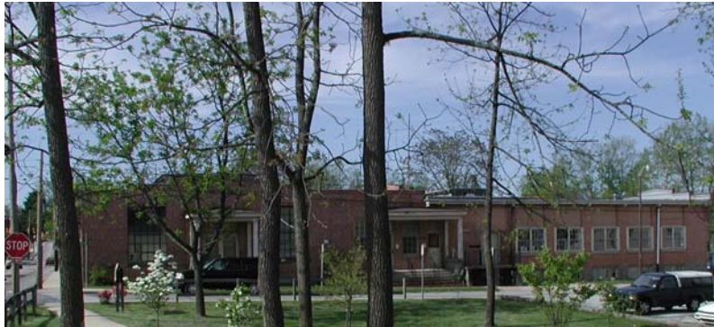
Historic Grey Hosiery Mill (Proposed Location for Mill Center)

For details regarding all the selected heritage tourism development initiatives – See Section Two.