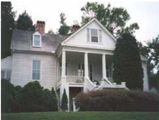
Carl Sandburg Home – National Historic Site