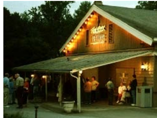
Flat Rock Playhouse – Flat Rock Historic District