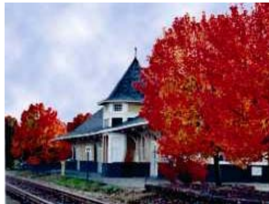
Seventh Avenue Railway Depot