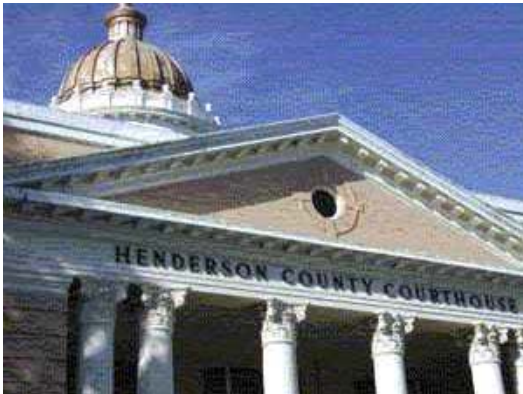
Historic Henderson County Courthouse

Several key heritage sites have been factored into this plan to capitalize on the growing heritage tourism industry and the popularity of our area. Among them: